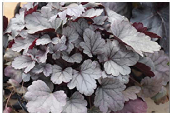
Dolce Silver Gumdrop Coral Bells foliage