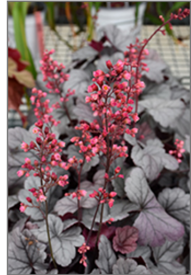
Dolce Silver Gumdrop Coral Bells flowers

This is a relatively low maintenance plant, and should be cut back in late fall in preparation for winter. It is a good choice for attracting hummingbirds to your yard. It has no significant negative characteristics.