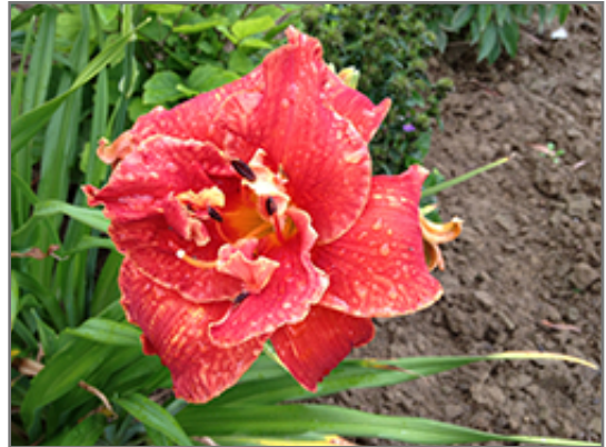
Moses Fire Daylily flowers

A vibrant orangy-red double daylily with ruffled edges; sturdy, strong, easy to care for, great grassy texture and form; good for the beginner gardener and the pro