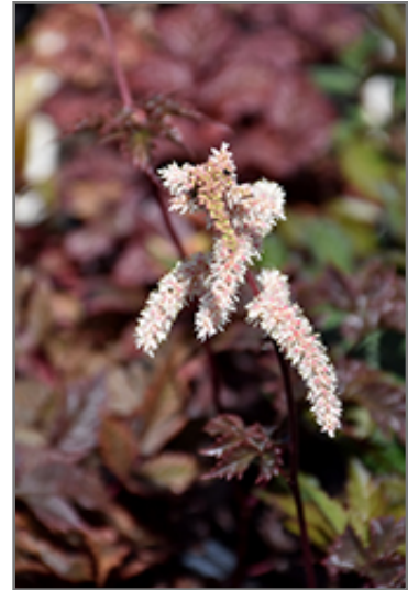
Chocolate Shogun Astilbe flowers

This is a relatively low maintenance plant, and is best cleaned up in early spring before it resumes active growth for the season. It is a good choice for attracting butterflies to your yard, but is not particularly attractive to deer who tend to leave it alone in favor of tastier treats. It has no significant negative characteristics.