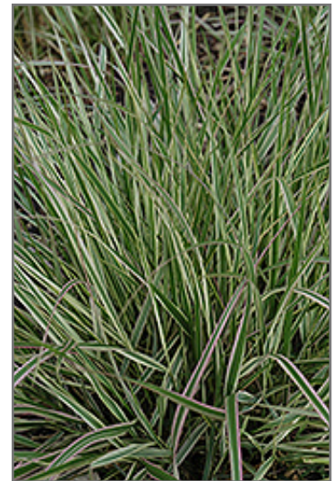
Variegated Reed Grass foliage

47747 Romeo Plank Road | Macomb, Mi 48044