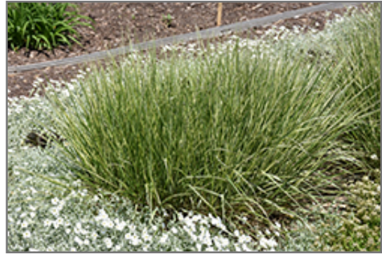
Variegated Reed Grass