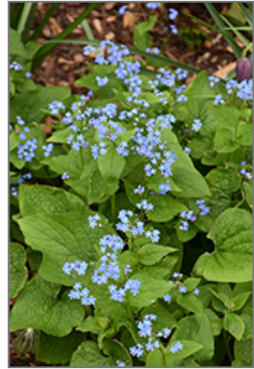
Siberian Bugloss flowers