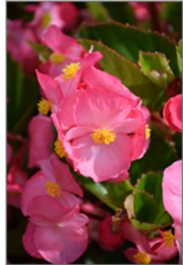
Big Pink Green Leaf Begonia flowers

This is a high maintenance plant that will require regular care and upkeep, and usually looks its best without pruning, although it will tolerate pruning. Deer don't particularly care for this plant and will usually leave it alone in favor of tastier treats. Gardeners should be aware of the following characteristic(s) that may warrant special consideration;