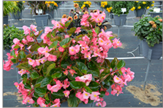
Big Pink Green Leaf Begonia in bloom

Big Pink Green Leaf Begonia is a fine choice for the garden, but it is also a good selection for planting in outdoor containers and hanging baskets. It is often used as a 'filler' in the 'spiller-thriller-filler' container combination, providing a mass of flowers and foliage against which the larger thriller plants stand out. Note that when growing plants in outdoor containers and baskets, they may require more frequent waterings than they would in the yard or garden.