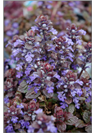
Bronze Beauty Bugleweed flowers