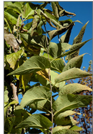
Prairie Sentinel Hackberry foliage