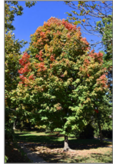
Endowment Sugar Maple