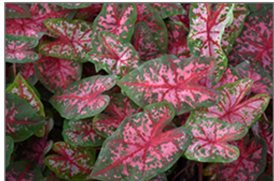
Carolyn Whorton Caladium foliage