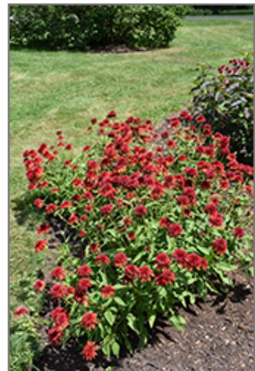
Double Scoop Orangeberry Coneflower in bloom

47747 Romeo Plank Road | Macomb, Mi 48044