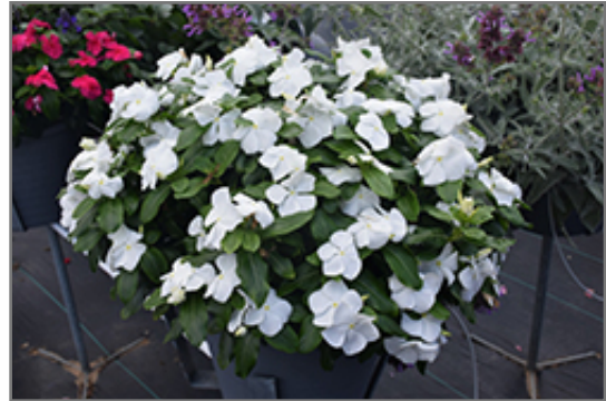
Titan Pure White Vinca in bloom

Titan Pure White Vinca will grow to be about 14 inches tall at maturity, with a spread of 12 inches. Its foliage tends to remain dense right to the ground, not requiring facer plants in front. Although it's not a true annual, this fast-growing plant can be expected to behave as an annual in our climate if left outdoors over the winter, usually needing replacement the following year. As such, gardeners should take into consideration that it will perform differently than it would in its native habitat.