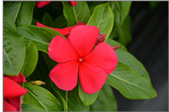
Titan Dark Red Vinca flowers

Titan Dark Red Vinca is recommended for the following landscape applications;