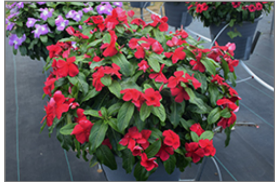
Titan Dark Red Vinca in bloom

Titan Dark Red Vinca will grow to be about 14 inches tall at maturity, with a spread of 12 inches. Its foliage tends to remain dense right to the ground, not requiring facer plants in front. Although it's not a true annual, this fast-growing plant can be expected to behave as an annual in our climate if left outdoors over the winter, usually needing replacement the following year. As such, gardeners should take into consideration that it will perform differently than it would in its native habitat.