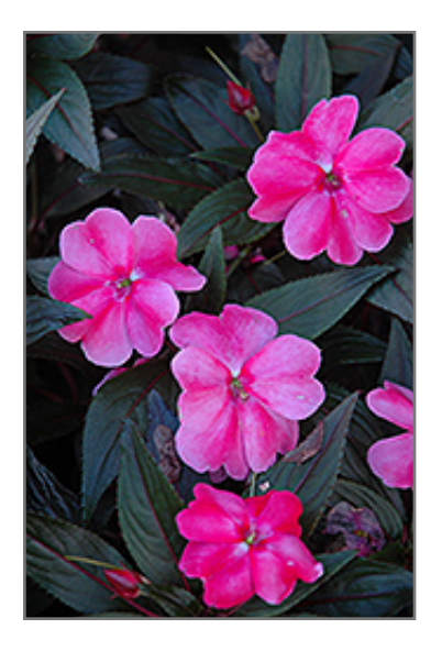
Harmony Pink Cream New Guinea Impatiens flowers

Early to flower with a mounded growth habit, perfect for hanging baskets, garden beds or borders; bright, vibrant blooms nestled atop dark green foliage add season-long color; easy to grow and low maintenance