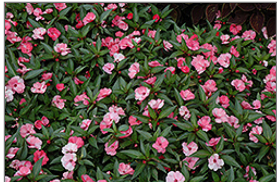
SunPatiens Spreading Pink Flash New Guinea Impatiens in bloom

47747 Romeo Plank Road | Macomb, Mi 48044