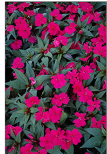
SunPatiens Compact Royal Magenta New Guinea Impatiens flowers

47747 Romeo Plank Road | Macomb, Mi 48044