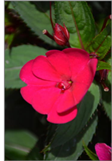
SunPatiens Compact Royal Magenta New Guinea Impatiens flowers

This plant will require occasional maintenance and upkeep, and should not require much pruning, except when necessary, such as to remove dieback. It is a good choice for attracting bees and butterflies to your yard. It has no significant negative characteristics.