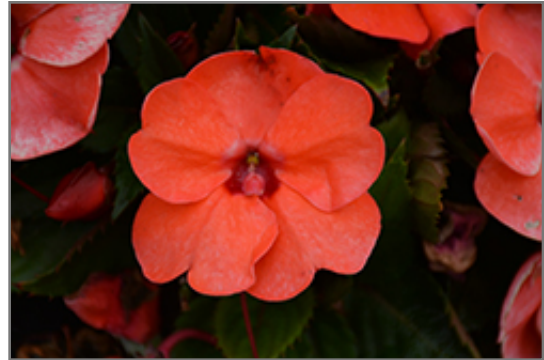
SunPatens Compact Hot Coral New Guinea Impatiens flowers

This plant will require occasional maintenance and upkeep, and should not require much pruning, except when necessary, such as to remove dieback. It is a good choice for attracting bees and butterflies to your yard. It has no significant negative characteristics.