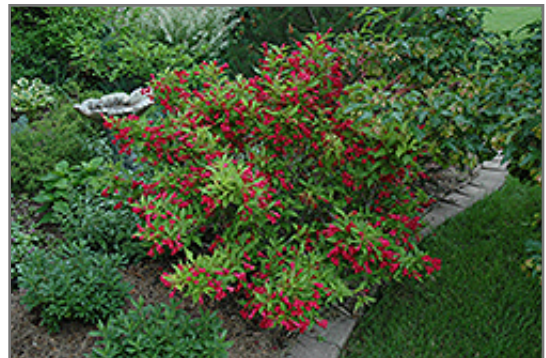
Red Prince Weigela in bloom

47747 Romeo Plank Road | Macomb, Mi 48044