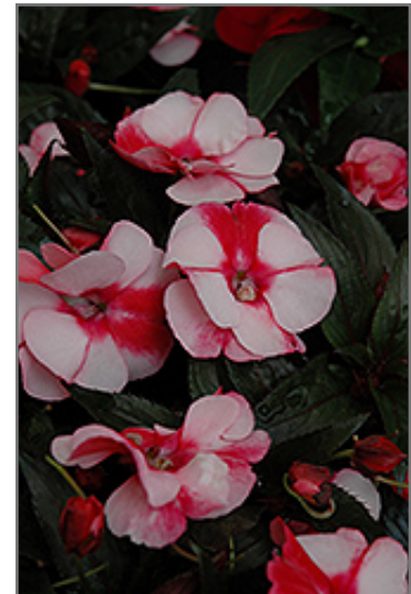
Sonic Sweet Cherry New Guinea Impatiens flowers

47747 Romeo Plank Road | Macomb, Mi 48044