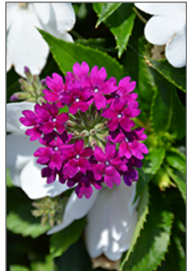
Superbena Royale Plum Wine Verbena flowers