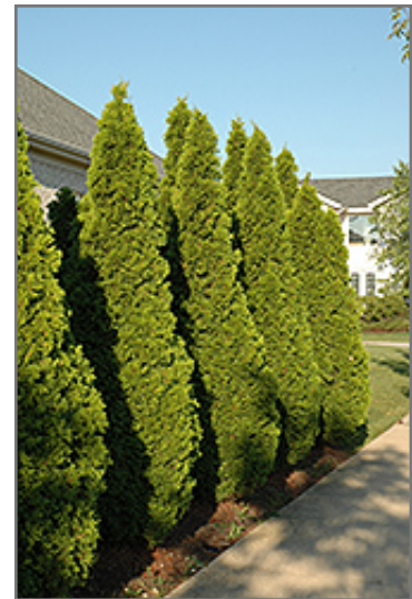
Emerald Green Arborvitae

47747 Romeo Plank Road | Macomb, Mi 48044