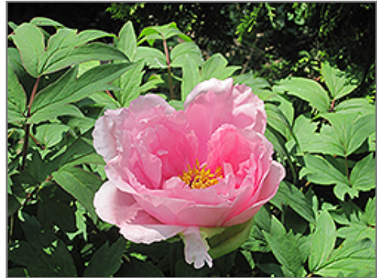
Hanakisoi Tree Peony flowers

47747 Romeo Plank Road | Macomb, Mi 48044