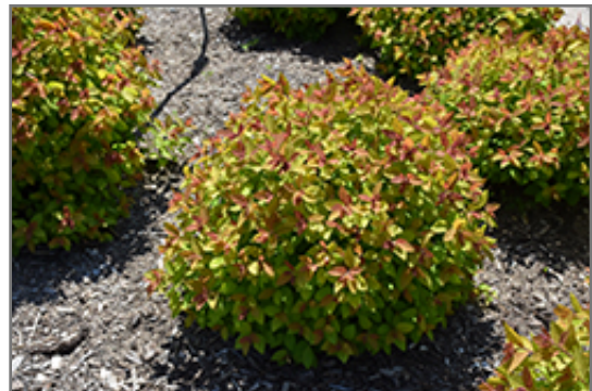
Double Play Big Bang Spirea