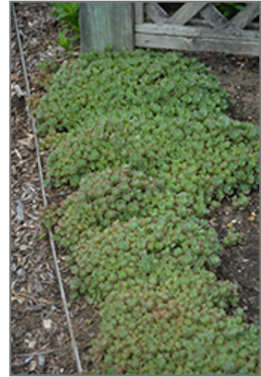
Lime Zinger Stonecrop

Lime Zinger Stonecrop will grow to be only 4 inches tall at maturity extending to 6 inches tall with the flowers, with a spread of 18 inches. When grown in masses or used as a bedding plant, individual plants should be spaced approximately 15 inches apart. Its foliage tends to remain low and dense right to the ground. It grows at a fast rate, and under ideal conditions can be expected to live for approximately 15 years. As an herbaceous perennial, this plant will usually die back to the crown each winter, and will regrow from the base each spring. Be careful not to disturb the crown in late winter when it may not be readily seen!