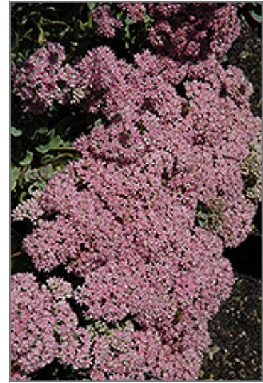
Lime Zinger Stonecrop flowers

This is a relatively low maintenance plant, and is best cleaned up in early spring before it resumes active growth for the season. It is a good choice for attracting bees and butterflies to your yard, but is not particularly attractive to deer who tend to leave it alone in favor of tastier treats. It has no significant negative characteristics.