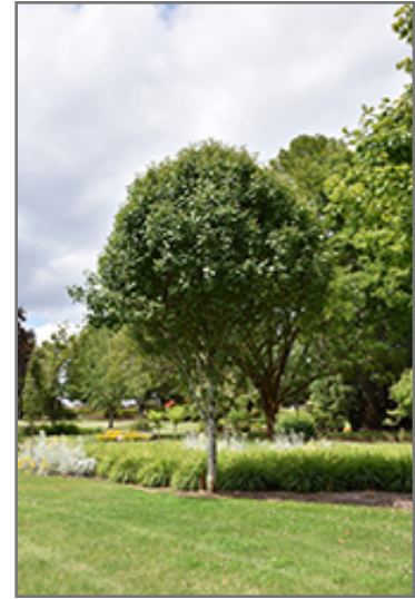
Jack Ornamental Pear

This tree should only be grown in full sunlight. It prefers to grow in average to moist conditions, and shouldn't be allowed to dry out. It is not particular as to soil type or pH. It is highly tolerant of urban pollution and will even thrive in inner city environments. This is a selected variety of a species not originally from North America.