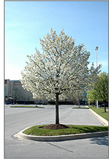
Jack Ornamental Pear in bloom