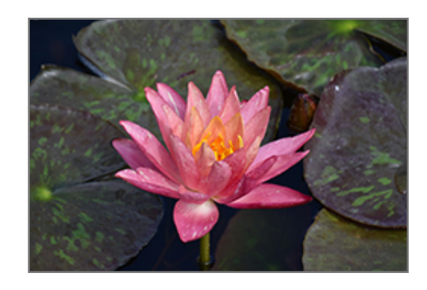
Wanvisa Hardy Water Lily flowers

This plant will require occasional maintenance and upkeep, and should be cut back in late fall in preparation for winter. It has no significant negative characteristics.