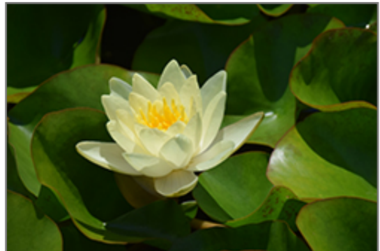
Marliacea Chromatella Hardy Water Lily flowers