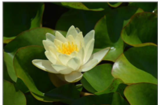
Marliacea Chromatella Hardy Water Lily flowers