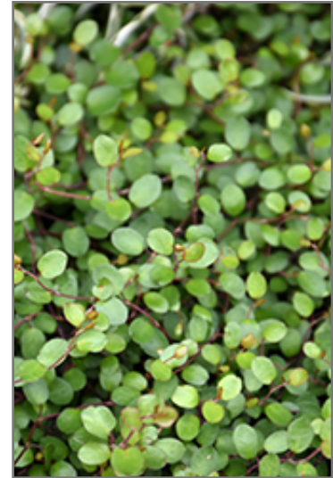
Creeping Wire Vine foliage