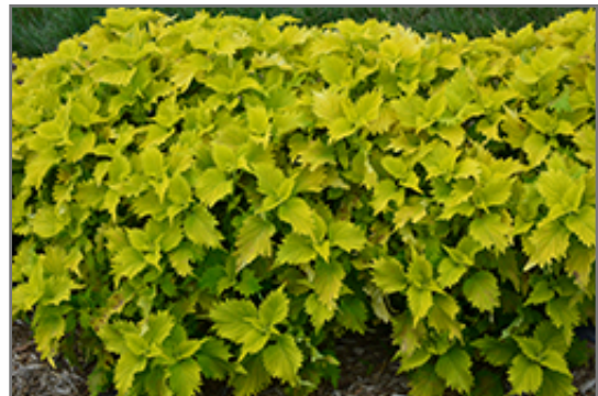
Wasabi Coleus