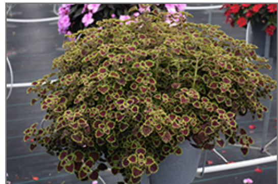
Burgundy Wedding Train Coleus