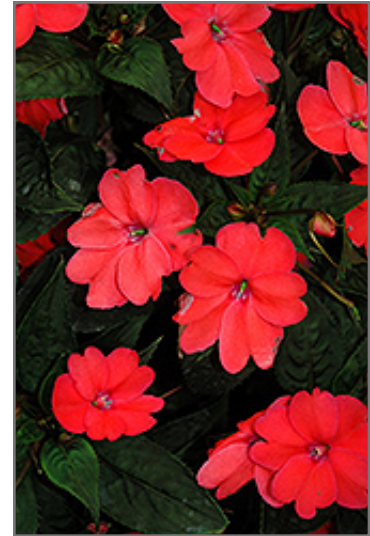
SunPatiens Compact Coral New Guinea Impatiens flowers

SunPatiens Compact Coral New Guinea Impatiens is recommended for the following landscape applications;