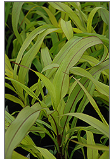
Jester Millet foliage

47747 Romeo Plank Road | Macomb, Mi 48044