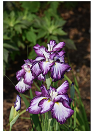
Lion King Japanese Flag Iris flowers

47747 Romeo Plank Road | Macomb, Mi 48044