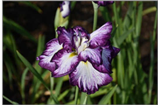
Lion King Japanese Flag Iris flowers

Lion King Japanese Flag Iris is an herbaceous perennial with tall flower stalks held atop a low mound of foliage. Its medium texture blends into the garden, but can always be balanced by a couple of finer or coarser plants for an effective composition.