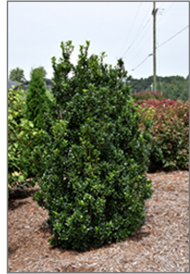
Castle Wall Meserve Holly

Castle Wall Meserve Holly is recommended for the following landscape applications;