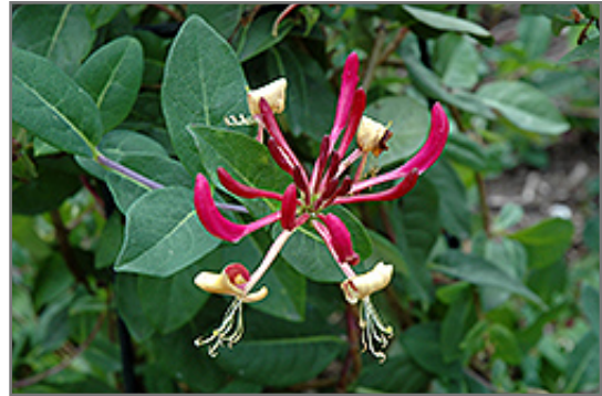
Peaches And Cream Honeysuckle flowers

This woody vine will require occasional maintenance and upkeep, and is best pruned in late winter once the threat of extreme cold has passed. It is a good choice for attracting butterflies and hummingbirds to your yard. It has no significant negative characteristics.