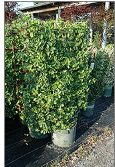
Manhattan Spreading Euonymus

47747 Romeo Plank Road | Macomb, Mi 48044