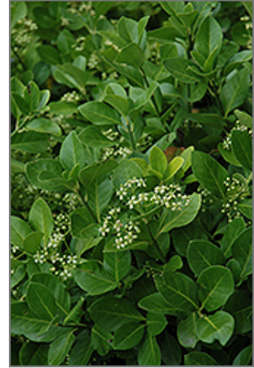
Manhattan Spreading Euonymus flowers

This shrub performs well in both full sun and full shade. It is very adaptable to both dry and moist locations, and should do just fine under average home landscape conditions. It is not particular as to soil type or pH. It is highly tolerant of urban pollution and will even thrive in inner city environments, and will benefit from being planted in a relatively sheltered location. This is a selected variety of a species not originally from North America.