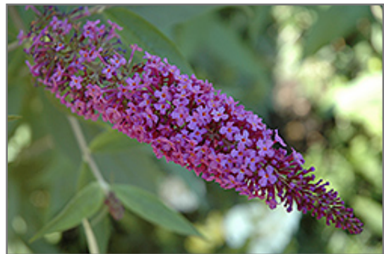
Flutterby Petite Blue Heaven Butterfly Bush flowers

47747 Romeo Plank Road | Macomb, Mi 48044