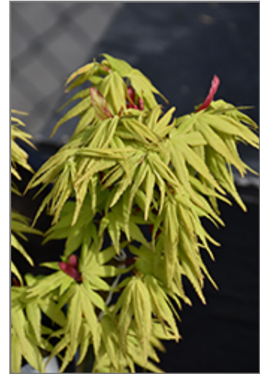
Mikawa Yatsubusa Japanese Maple foliage

Mikawa Yatsubusa Japanese Maple is recommended for the following landscape applications;