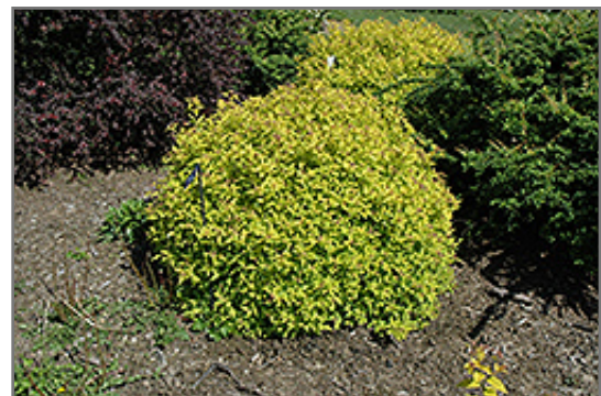
Lemon Princess Spirea