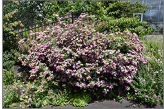
Lemon Princess Spirea in bloom

Lemon Princess Spirea will grow to be about 24 inches tall at maturity, with a spread of 3 feet. It tends to fill out right to the ground and therefore doesn't necessarily require facer plants in front. It grows at a fast rate, and under ideal conditions can be expected to live for approximately 20 years.