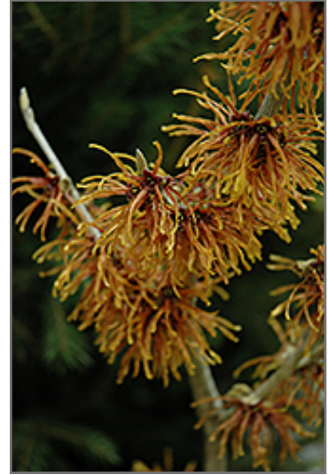
Jelena Witchhazel flowers

Jelena Witchhazel is recommended for the following landscape applications;