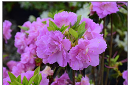
Elsie Lee Azalea flowers