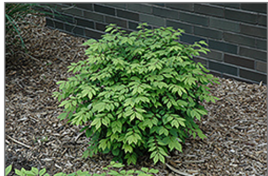
Little Moses Burning Bush