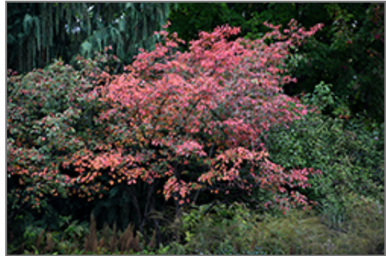
Autumn Brilliance Serviceberry in fall

This tree does best in full sun to partial shade. It prefers to grow in average to moist conditions, and shouldn't be allowed to dry out. It is not particular as to soil type or pH. It is somewhat tolerant of urban pollution. This particular variety is an interspecific hybrid.