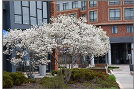
Autumn Brilliance Serviceberry in bloom

Autumn Brilliance Serviceberry is recommended for the following landscape applications;