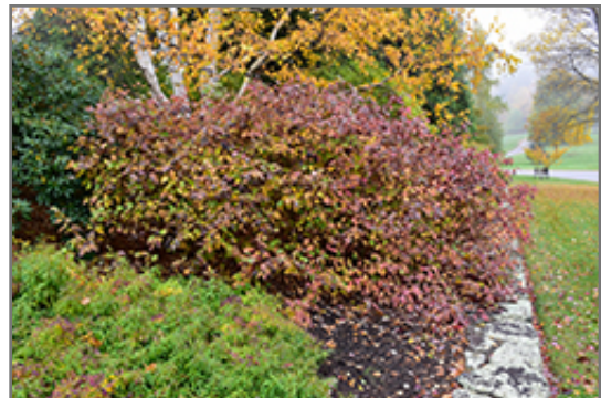
Bailey Red-Twig Dogwood in fall