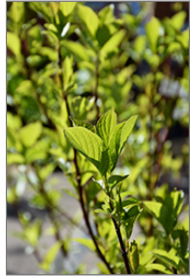
Bailey Red-Twig Dogwood foliage

This shrub does best in full sun to partial shade. It is an amazingly adaptable plant, tolerating both dry conditions and even some standing water. It is not particular as to soil type or pH. It is highly tolerant of urban pollution and will even thrive in inner city environments. This species is native to parts of North America.