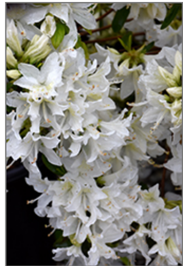
Cascade Azalea flowers