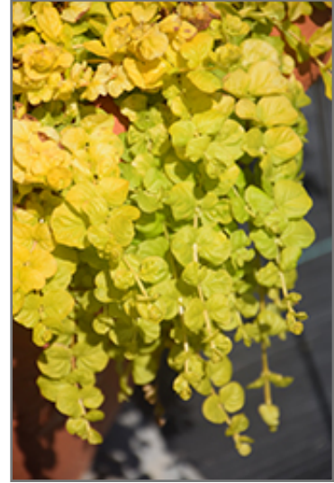
Goldilocks Creeping Jenny foliage