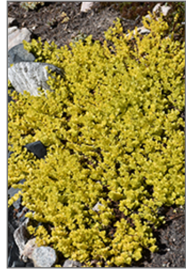
Goldilocks Creeping Jenny

Goldilocks Creeping Jenny will grow to be only 6 inches tall at maturity, with a spread of 3 feet. When grown in masses or used as a bedding plant, individual plants should be spaced approximately 24 inches apart. Its foliage tends to remain low and dense right to the ground. It grows at a fast rate, and under ideal conditions can be expected to live for approximately 10 years. As an herbaceous perennial, this plant will usually die back to the crown each winter, and will regrow from the base each spring. Be careful not to disturb the crown in late winter when it may not be readily seen!