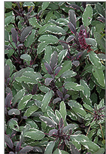
Tricolor Sage foliage