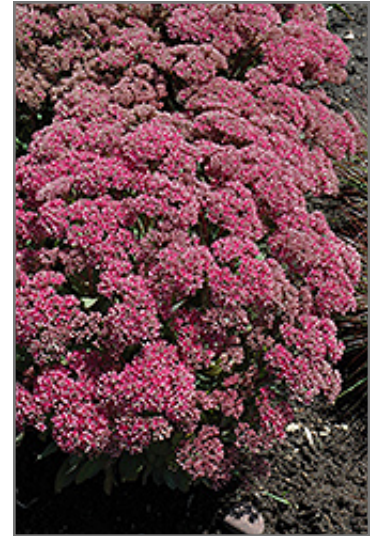
Mr. Goodbud Stonecrop flowers

Mr. Goodbud Stonecrop is recommended for the following landscape applications;