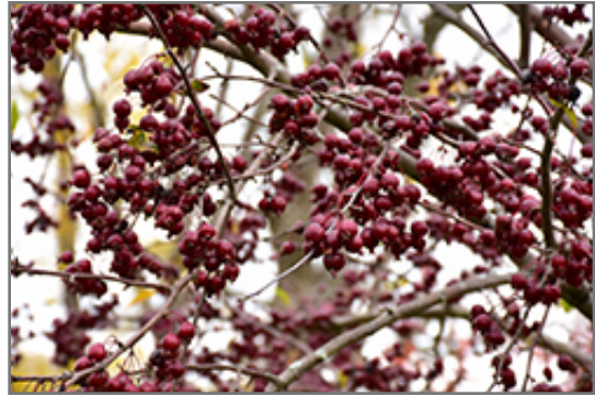
Purple Prince Flowering Crab fruit

This tree should only be grown in full sunlight. It prefers to grow in average to moist conditions, and shouldn't be allowed to dry out. It is not particular as to soil type or pH. It is highly tolerant of urban pollution and will even thrive in inner city environments. This particular variety is an interspecific hybrid.