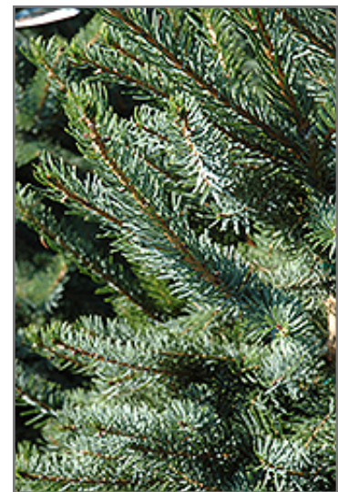
Bruns Spruce foliage